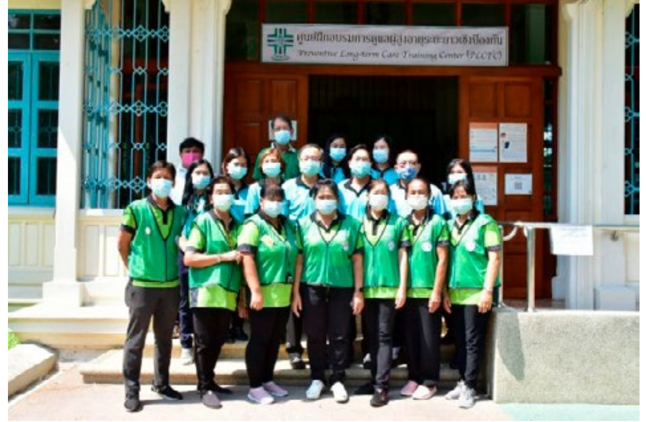
The Bangkok Metropolitan Administration trains volunteers in long-term care prevention.

But when medical issues do arise, it is also important for communities and various sectors to come together to ensure that care is accessible and effective, and that care providers have the support they need. In this section, we examine three