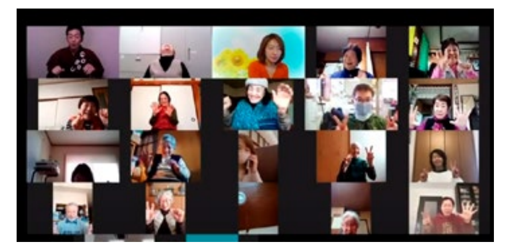
An online kayoinoba organized by the Matsudo Project