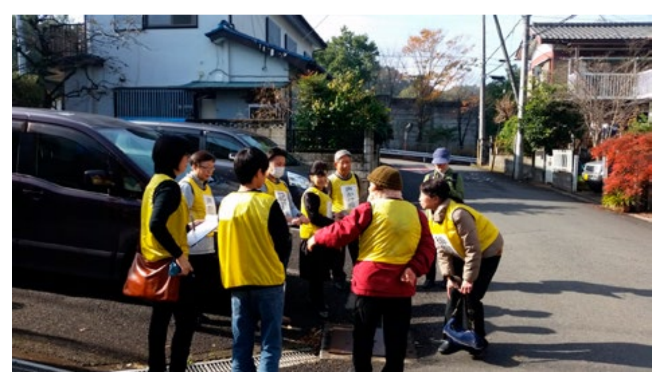
In Iruma, Japan, volunteers practice ways to recognize and assist someone with dementia who has wandered off.

Our final case study is an example of a private company working together with local government to protect people with dementia who might be prone to wandering in their local community, offering a solution that is low cost and non-intrusive.