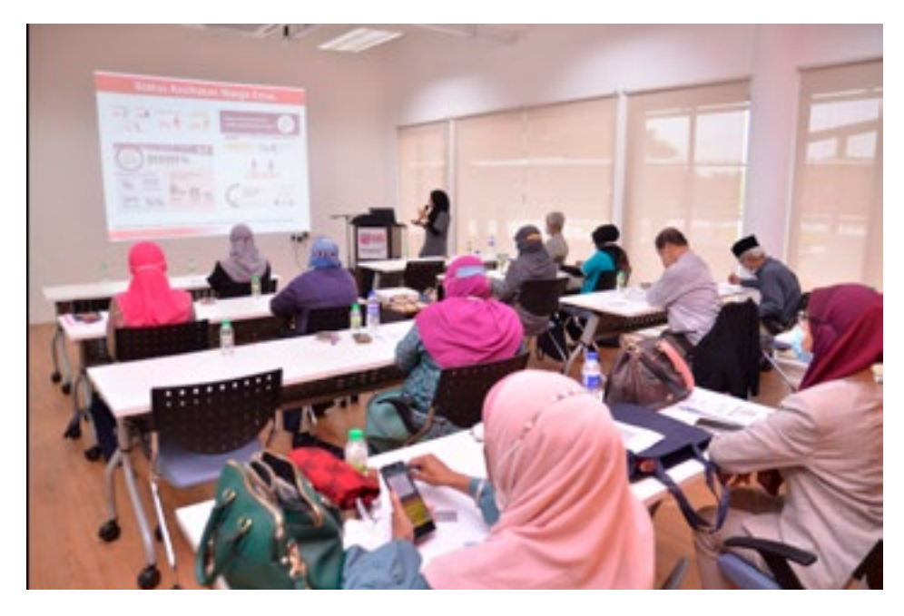
The autonomous robotic platform developed by the Malaysian Research Institute on Ageing

the virus (since misinformation was rampant). The visits also included guidance on how to do at-home exercises to improve immunity, balance, and physical fitness. But most importantly, they were able to reinforce a spirit of community engagement and mutual support.