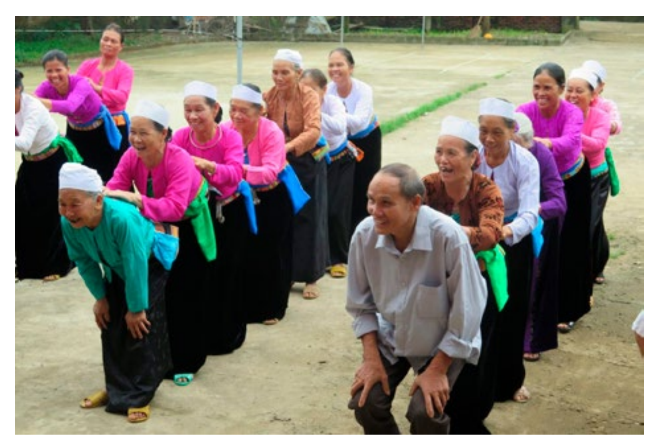
Participants enjoying one of the activities of HelpAge International in Vietnam's Intergenerational Self-Help Clubs

The two case studies below offer unique cases of innovations that seek to engage older residents in their communities—one by reaching out to older residents who are in need of long-term care or are less mobile than they once were and getting them into town more regularly for shopping, dining, and recreation, and the other by creating citizen-led "self-help clubs" that engage members in designing a holistic set of programs to address the social, physical, mental, and economic needs in the community.