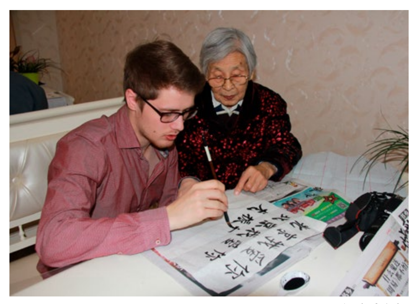
Longzhen Senior Care

In our second case, Grundtvig.inc set up its nursing care operations in a semipublic housing complex administered by Japan's Urban Renaissance Agency and worked to create an environment that would resemble an extended family, drawing in nurses and care providers as residents, and encouraging younger families to move in as well. By promoting intergenerational connections and revitalizing the community, their focus is on ensuring that older residents are not only healthy but are able to enjoy a fulfilling life on their own terms.